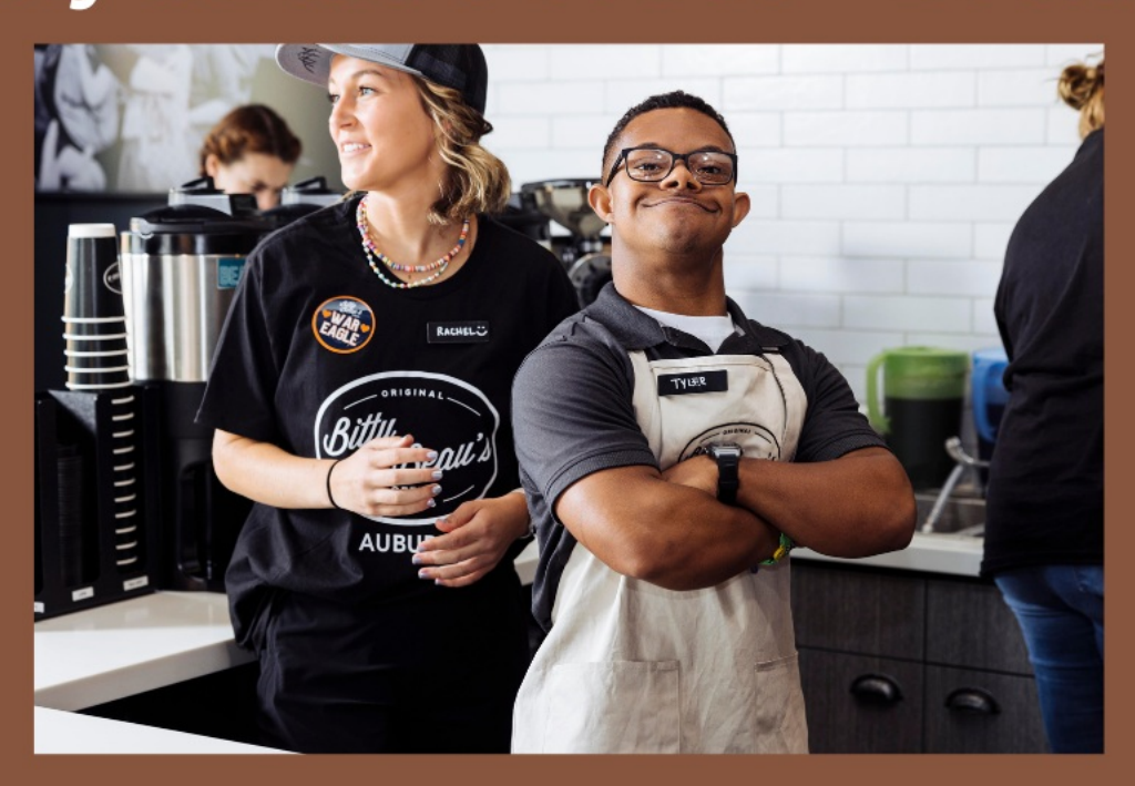
Bitty & Beau's Coffee is coming to Boulder in the coming weeks to 1468 Pearl Street. You can read more about them at www.bittyandbeauscoffee.com

Bitty & Beau's Coffee is more than just a place to grab a cup of coffee — it's an experience. The shops are run by people with disabilities and guests love the vibe in the shop! St. Aidan's will be hosting their hiring fair at our facilities on August 12th to help them find incredible candidates. The hiring fair is a one-day event where all interested candidates gather to learn more about Bitty & Beau's Coffee and interview for a job. The aim of the event is to get a sense of everyone's personalities and interests so they can place them in a role that offers the greatest opportunity to shine. Their Hiring Fair is designed as a fun, relaxed and memorable experience for everyone!