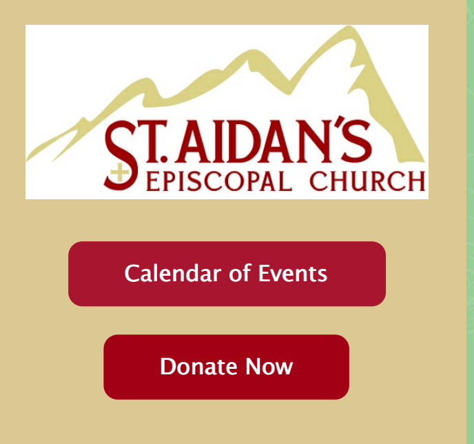
The Church Office is closed on Monday and Tuesday this week for July 3 (Dead&Co Concert) and July 4 Independence Day!