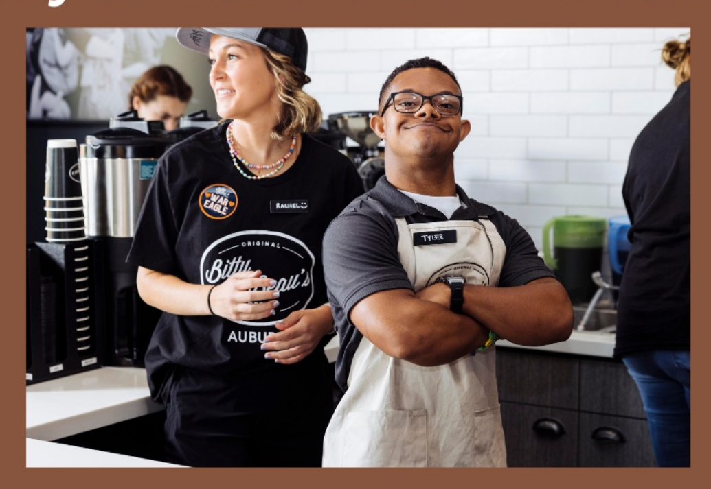
Bitty & Beau's Coffee is coming to Boulder in the coming weeks to 1468 Pearl Street. You can read more about them at www.bittyandbeauscoffee.com

Bitty & Beau's Coffee is more than just a place to grab a cup of coffee — it's an experience. The shops are run by people with disabilities and guests love the vibe in the shop! St. Aidan's will be hosting their hiring fair at our facilities on August 12th to help them find incredible candidates. The hiring fair is a one-day event where all interested candidates gather to learn more about Bitty & Beau's Coffee and interview for a job. The aim of the event is to get a sense of everyone's personalities and interests so they can place them in a role that offers the greatest opportunity to shine. Their Hiring Fair is designed as a fun, relaxed and memorable experience for everyone!