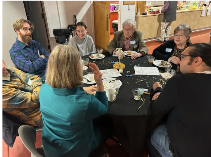
A table enjoying conversation and what makes St. Aidan's home for each of us.

Take Faith Home Proper 19 Sunday September 17, 2023