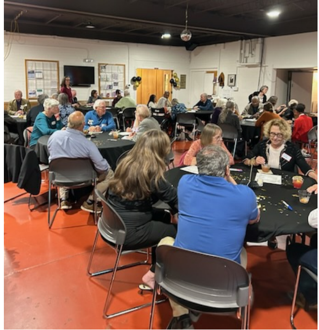
A Gingly Pat Parish Hall filled with stories and conversation, hope and history.