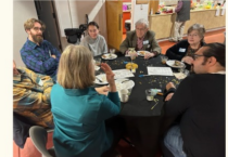
St. Aidan's 25th Anniversary on September 15

Click Here to Make Your 2024 Annual Giving Pledge Online Now