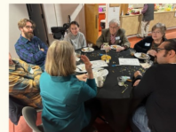
St. Aidan's 25th Anniversary on September 15

Click Here to Make Your 2024 Annual Giving Pledge Online Now