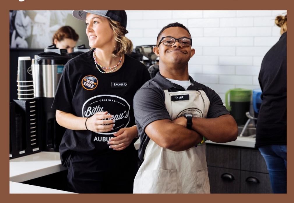
Bitty & Beau's Coffee is coming to Boulder in the coming weeks to 1468 Pearl Street. You can read more about them at www.bittyandbeauscoffee.com

Bitty & Beau's Coffee is more than just a place to grab a cup of coffee — it's an experience. The shops are run by people with disabilities and guests love the vibe in the shop! St. Aidan's will be hosting their hiring fair at our facilities on August 12th to help them find incredible candidates. The hiring fair is a one-day event where all interested candidates gather to learn more about Bitty & Beau's Coffee and interview for a job. The aim of the event is to get a sense of everyone's personalities and interests so they can place them in a role that offers the greatest opportunity to shine. Their Hiring Fair is designed as a fun, relaxed and memorable experience for everyone!